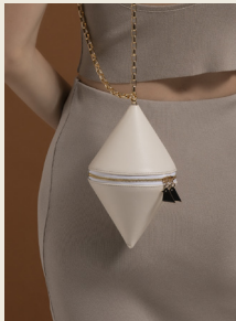
Night on the town.