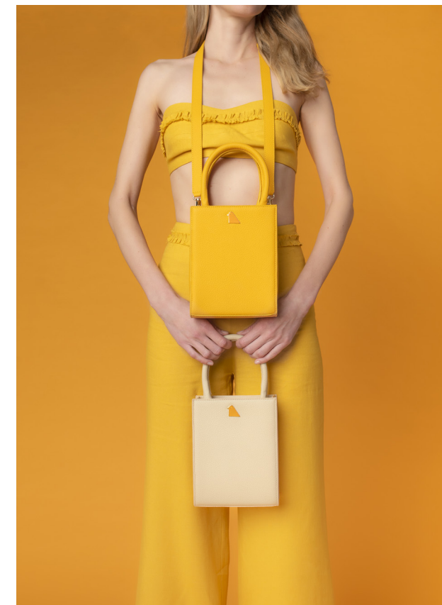
Tote in Mustard Yellow & Beige