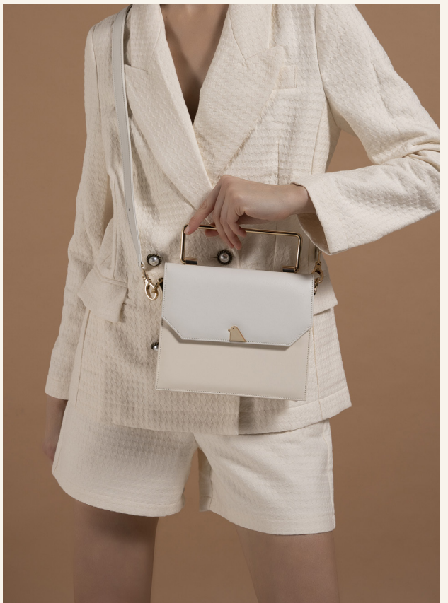
Modena in White