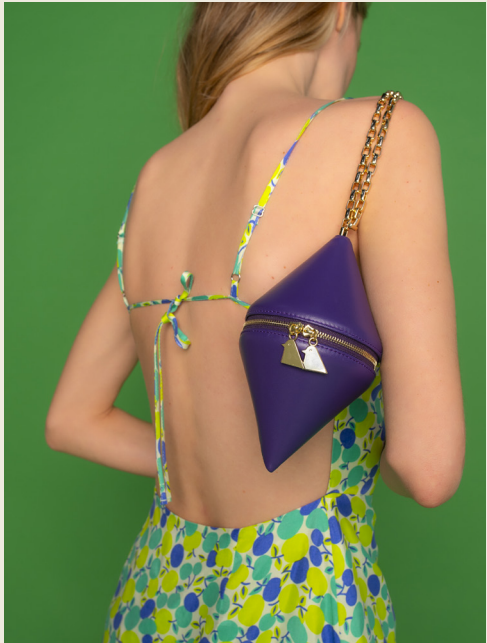
An adorably small crossbody bag.