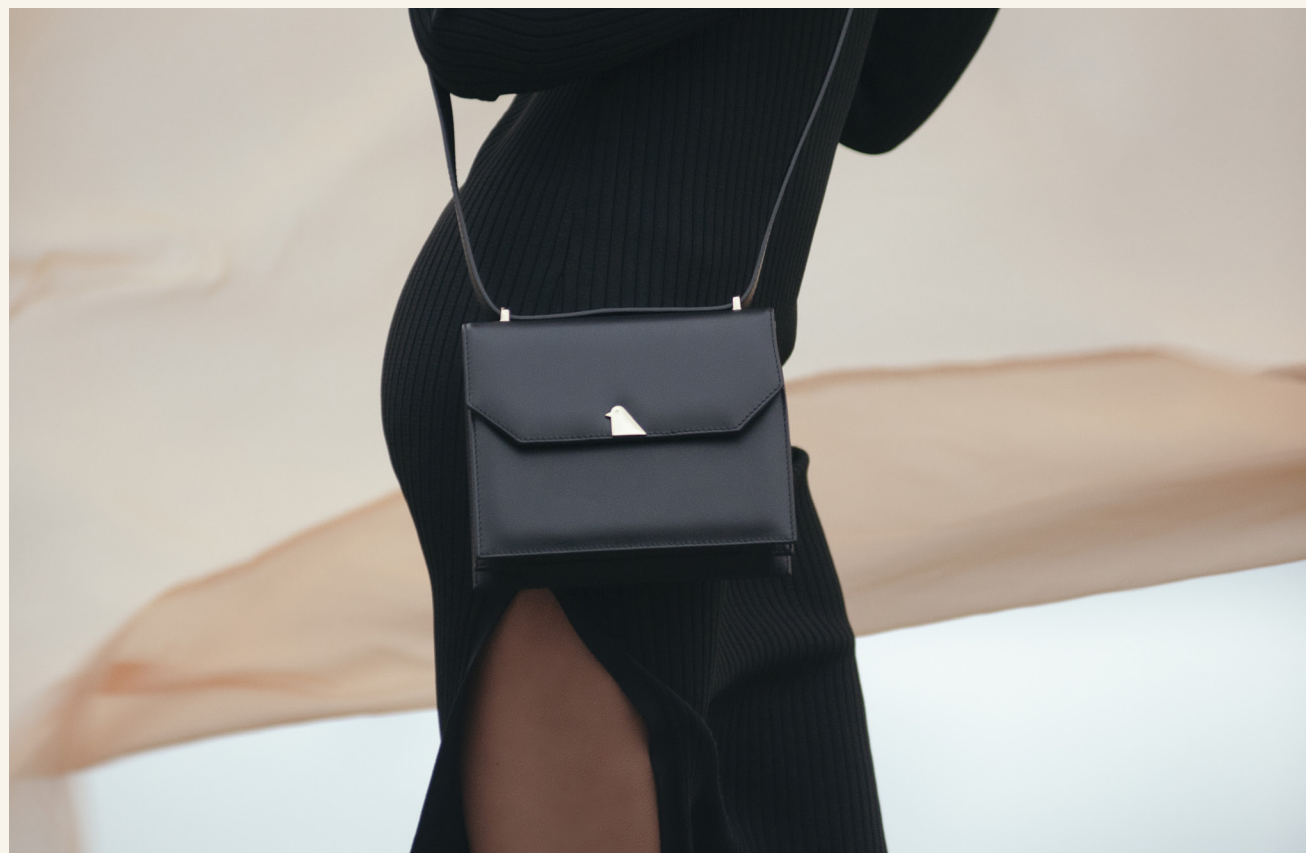
Modena in Black