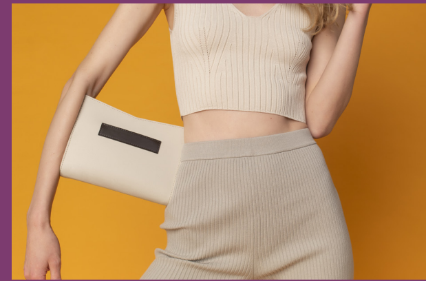
Barb in Beige