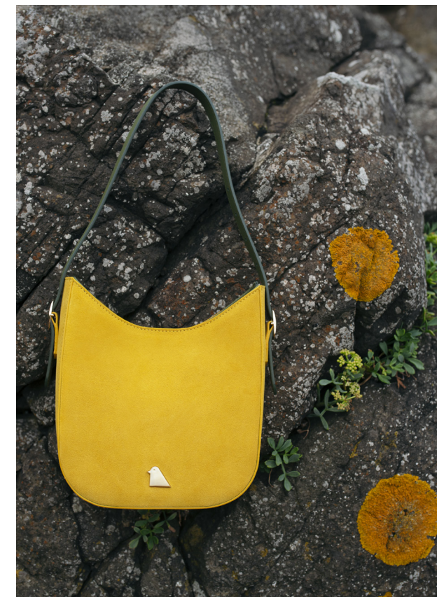
Ruby in Mustard Yellow