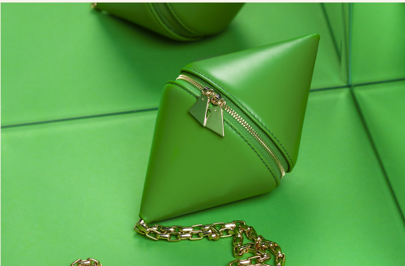
Mookee in Grass Green