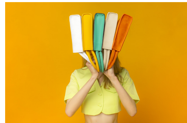
Tote Color Palette