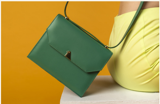
Modena in Emerald Green