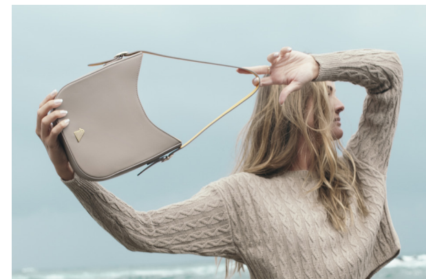
Ruby in Taupe