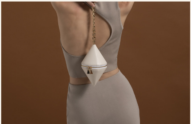
Mookee in White