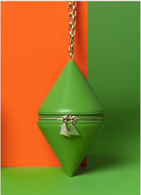
You'll love the near-weightless and hands-free ease while on the go.